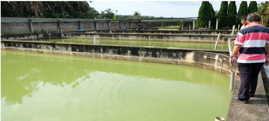
Fresh Water Prawn or Udang Galah (Macrobrachium rosenbergii)